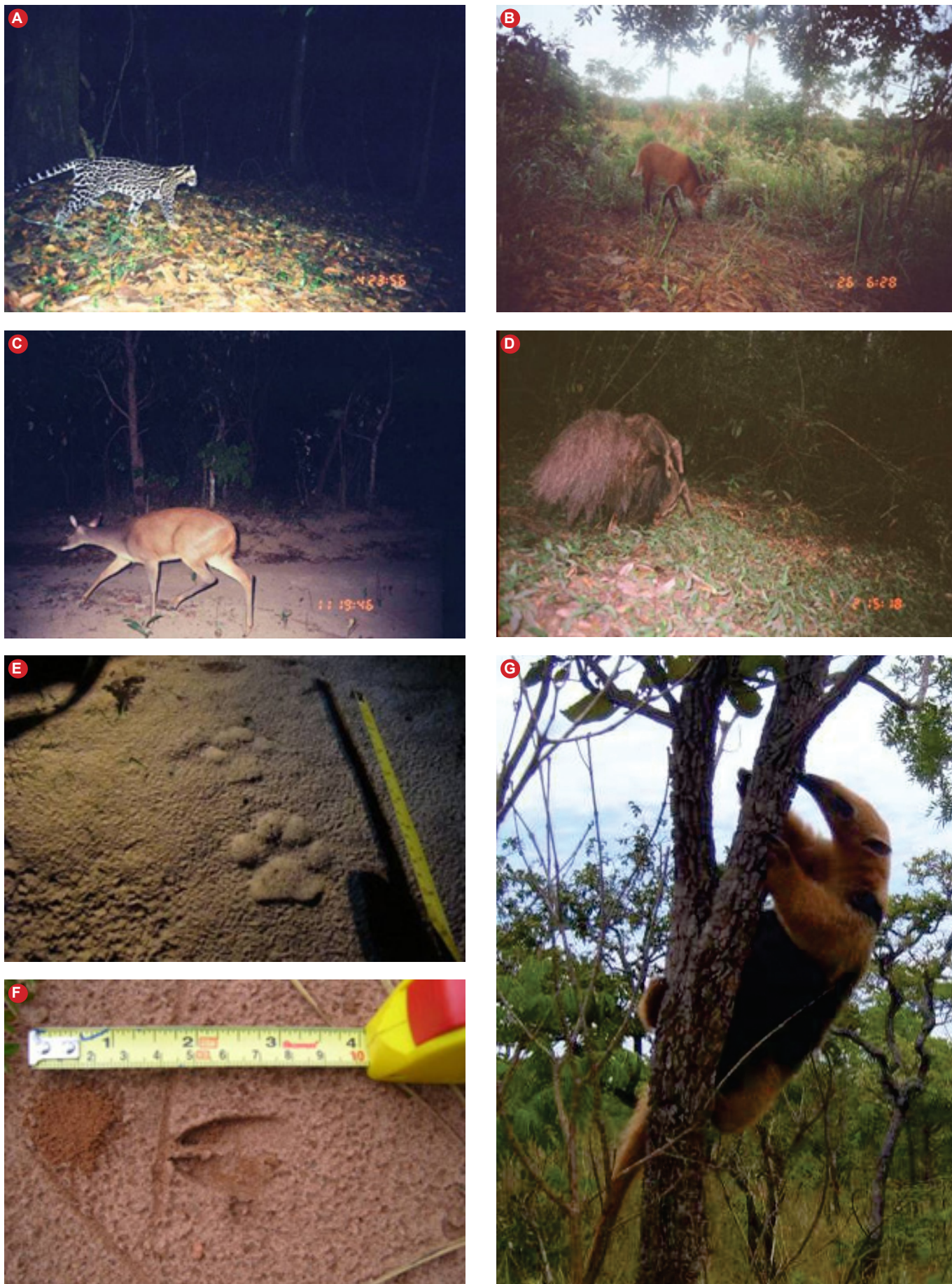
FIGURE 3. Photographic records of mammals captured with camera traps or observed indirectly at the Estação Ecológica do Panga (Minas Gerais State, Brazil). (A) Leopardus pardalis in mata ciliar, (B) Chrysocyon brachyurus in vereda, (C) Mazama guazoubira in cerrado sentido restrito, (D) Adult Myrmecophaga tridactyla carrying juvenile in mata ciliar, (E) Puma concolor tracks in cerrado sentido restrito, (F) Mazama guazoubira track in cerrado ralo, (G) Tamandua tetradactyla in cerrado ralo.